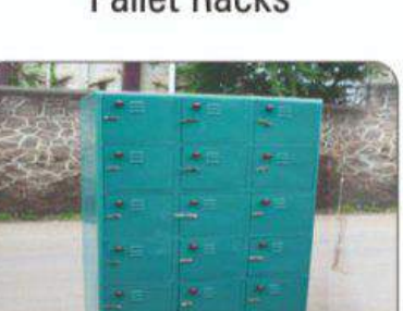
18 Door Locker