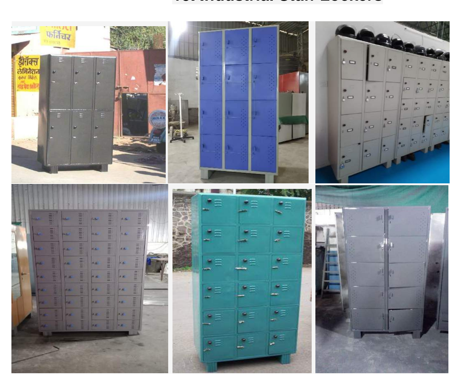
We are the Leading, Manufacturer, and Supplier of all types of industrial staff lockers.