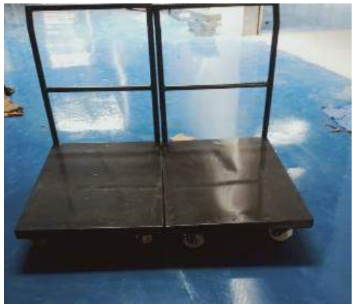
We are the Leading, Manufacturer, and Supplier of all types of industrial Material Movement Trollies.