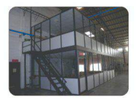
Mezzanine Floor With Office