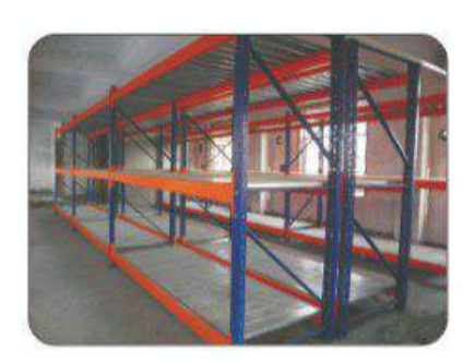
Heavy Duty Rack